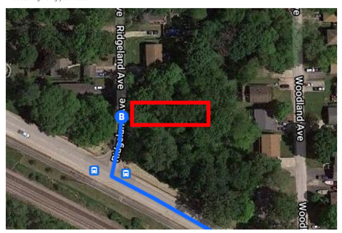
your route accordingly. You must obey all signs or notices regarding your route.