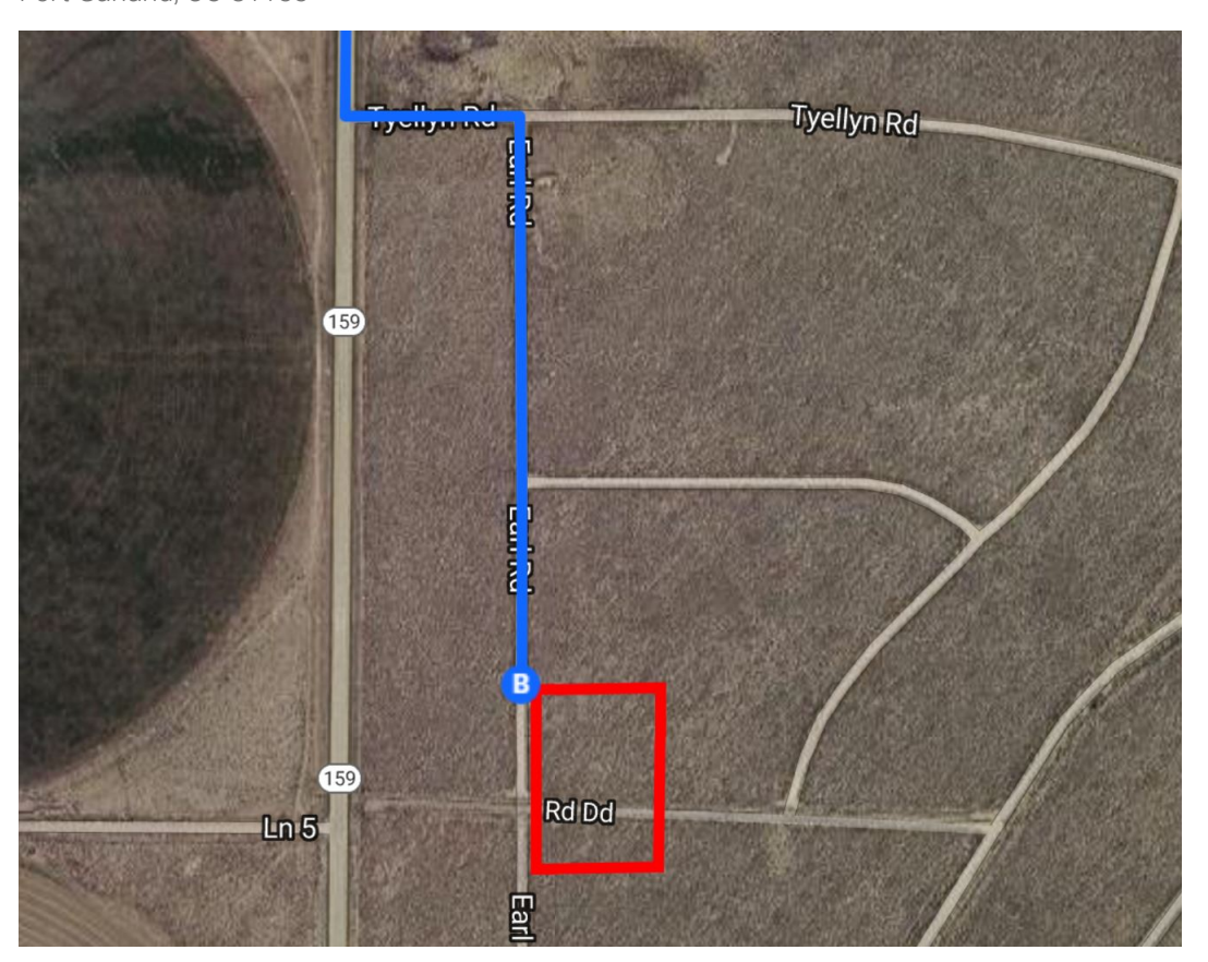
Rd Dd Fort Garland, CO 81133